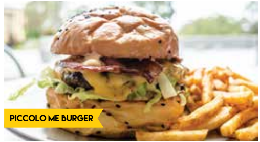
PICCOLO ME BURGER

Cheeseburger Eddy $12 Angus Beef, cheese, grilled onions, pickles, mustard & tomato sauce on a croissant (Ask for it to be on a Croissant to make it a Cheesy Frenchy)